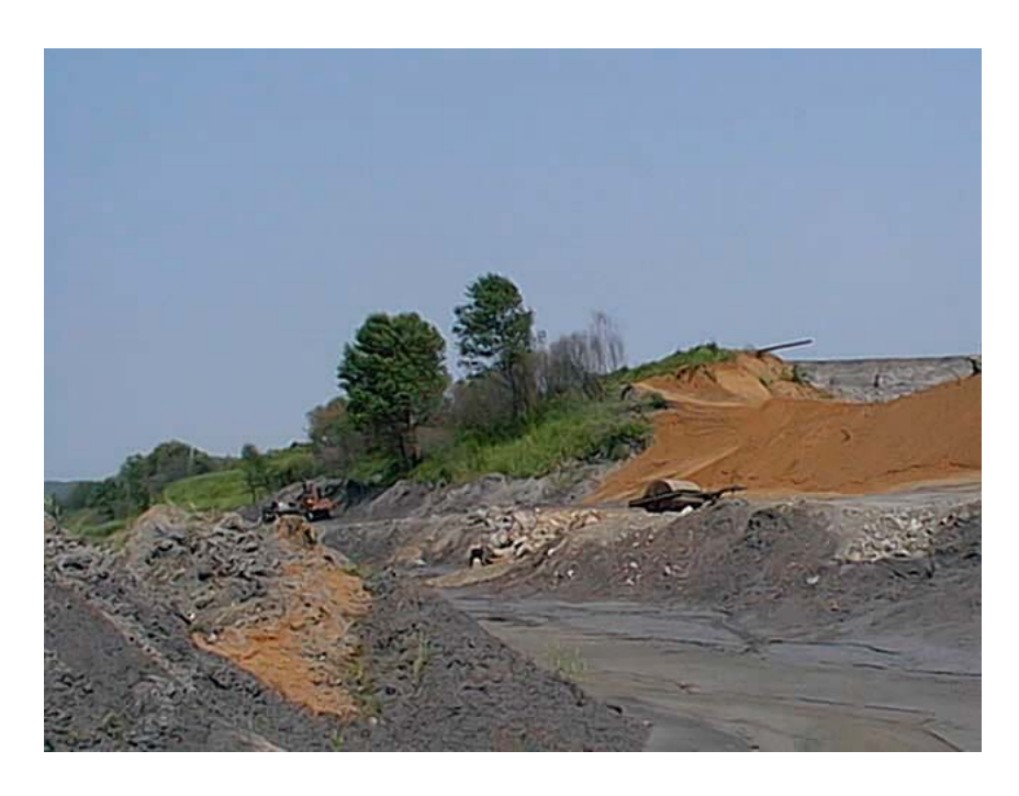
2 of 7 - View of drainage canal filled with fly ash and construction equipment removing portions of toe of dam