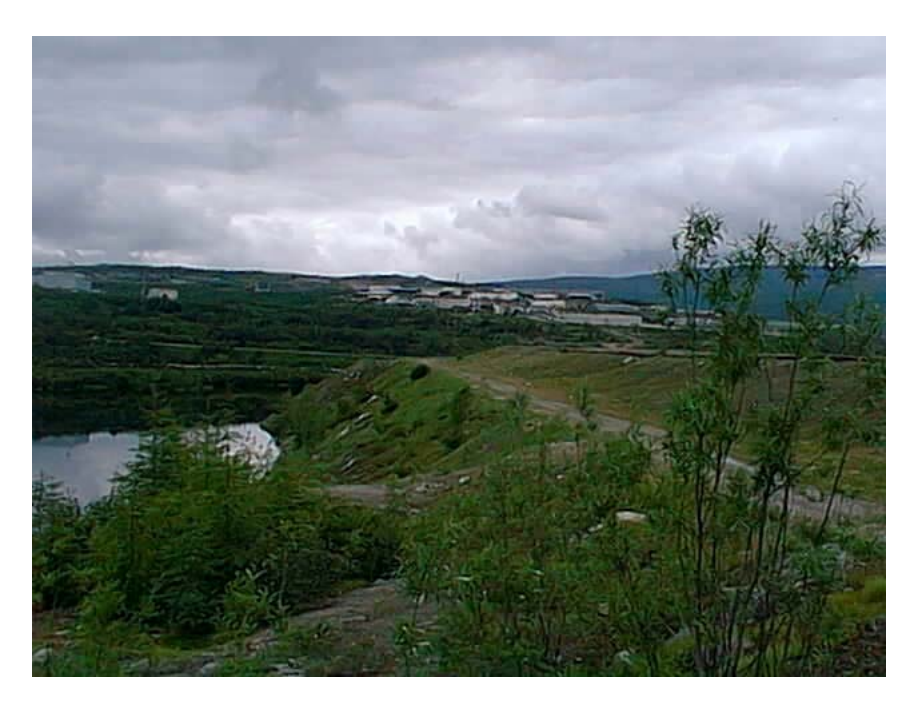
7 of 7 - View of downstream face of Magadan Power Plant coal ash dam showing the toe of the dam located in the floodplain of the Magadan River