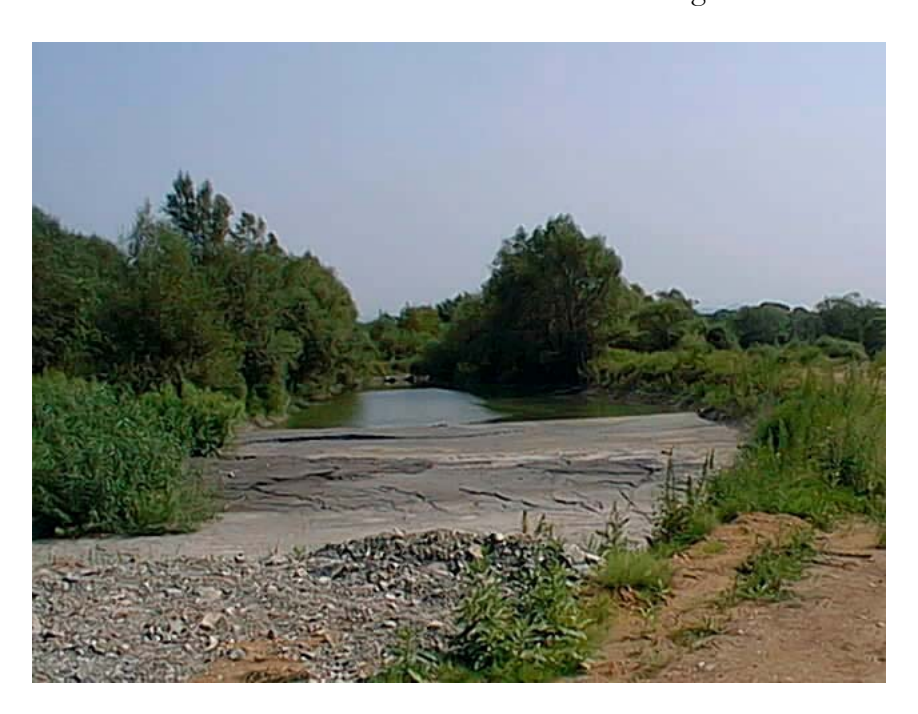
5 of 7 - View of ash where drainage canal discharges to tributary to Partizanskaya River