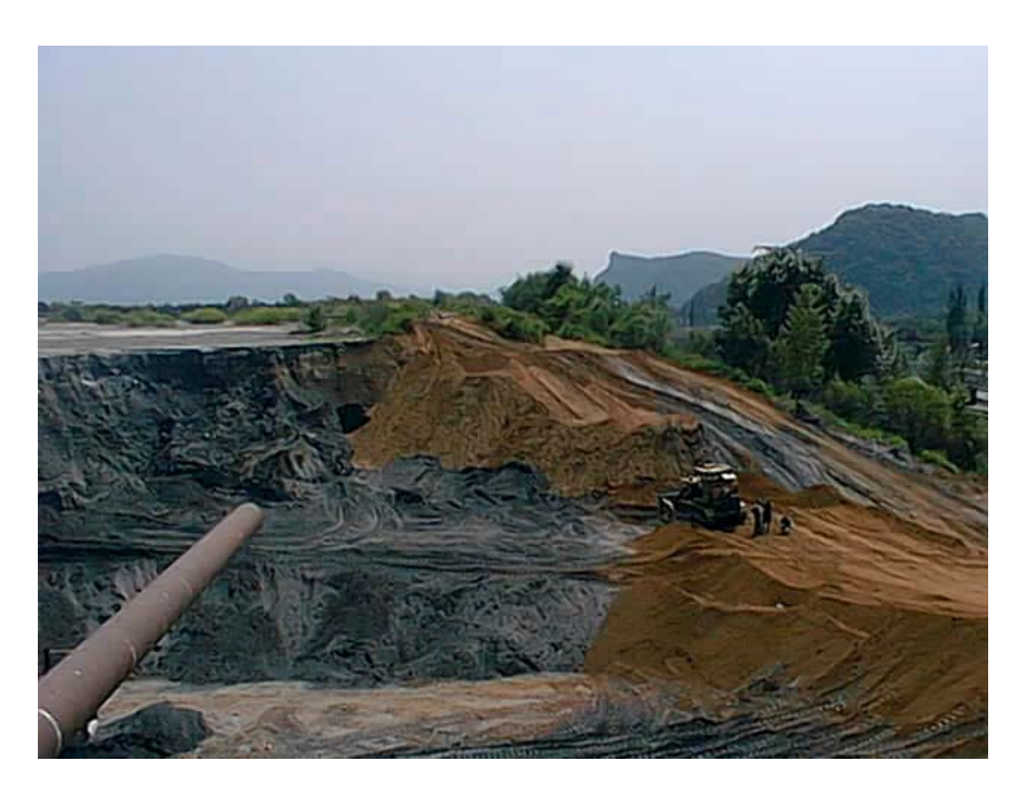
4\ \mathrm{of}\ 7 - View of breach zone from within the ring dike dam