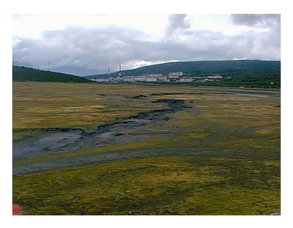
6 of 7- View of full coal ash disposal dam - a ring dike - at primary power plant at Magadan City located in flood plain of Magadan River