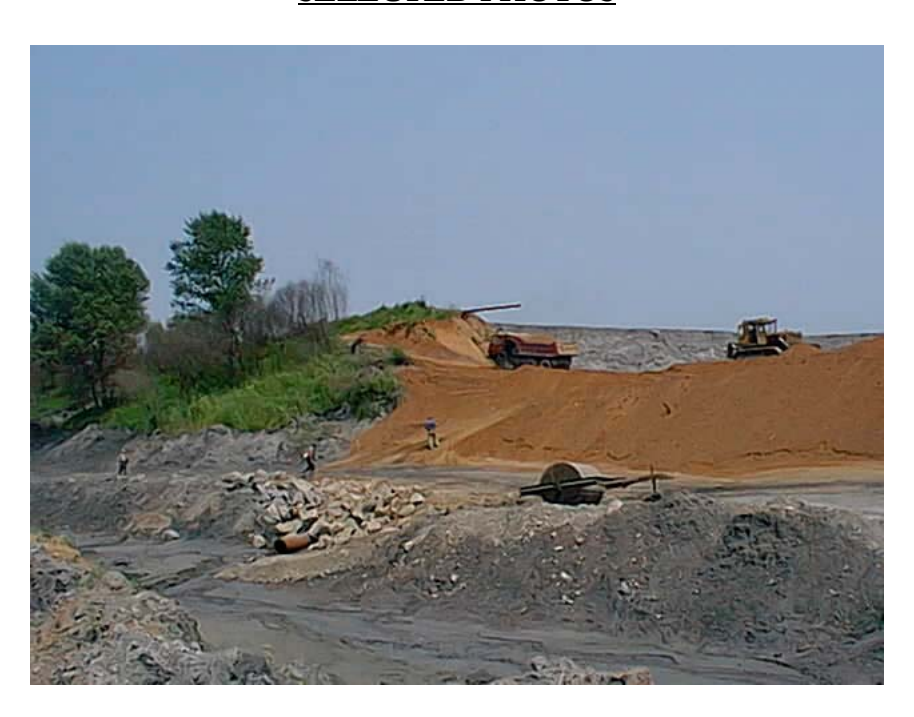
1 of 7 - View of the breach area being filled in also showing the height of the dam, the discharge point for emergency drainage pipe at the base of the breach area, the slope of dam and the height of mature trees growing in dam