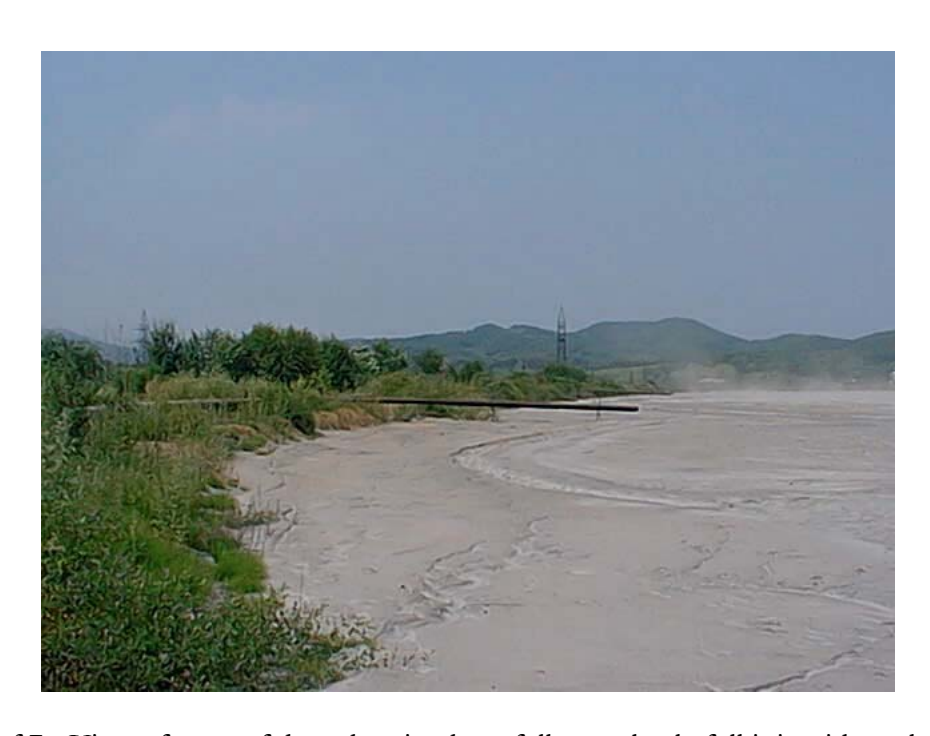
3 of 7 - View of crest of dam showing how full completely full it is with coal ash