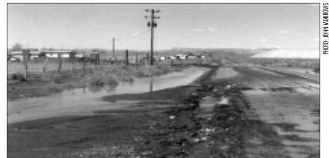
Runoff from February 16, 1979 Homestake mill dam breach, Thunderbird Road, Milan, NM.