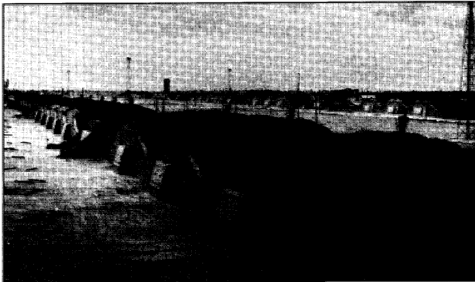
Plutonium "pit" storage bunkers at the Pantex site.