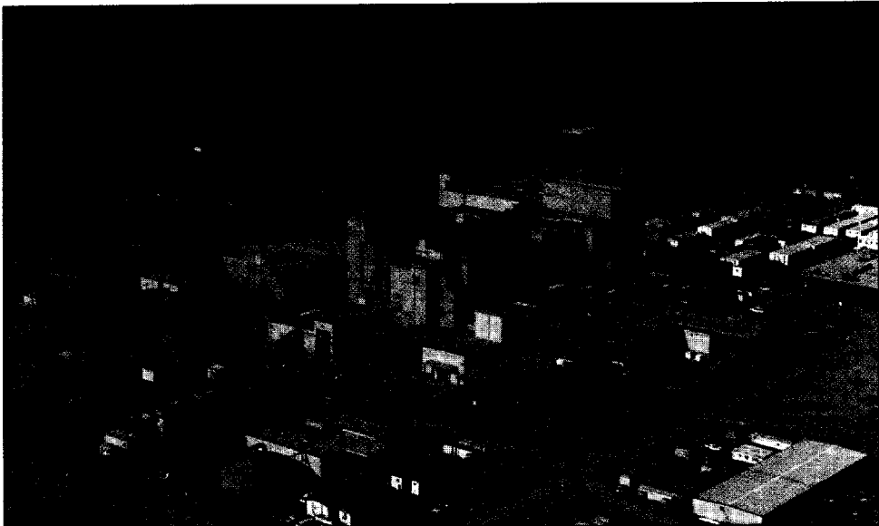
The $2 billion radioactive waste vitrification plant near Aiken, South Carolina.

..... In principle, the two plants now being built could vitrify surplus military plutonium along with other radioactive wastes.