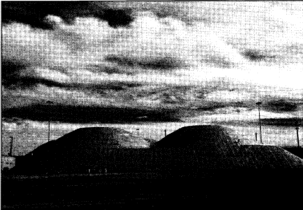
The Pantex nuclear weapons assembly/disassembly plant near Amarillo, Texas.

..... The opportunity for mutual arsenal reductions is testing DOE's capacities and intentions.