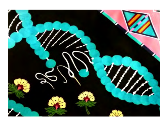
artwork by Mallery Quetawki, Artist-in-Residence, UNM Center for Native Environmental Health Equity Research